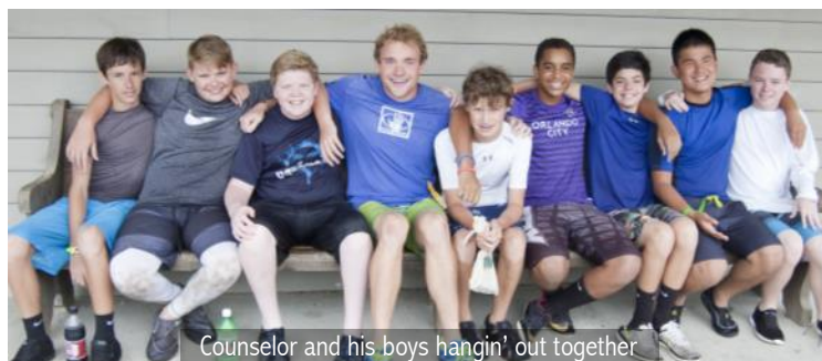
Counselor and his boys hangin' out together