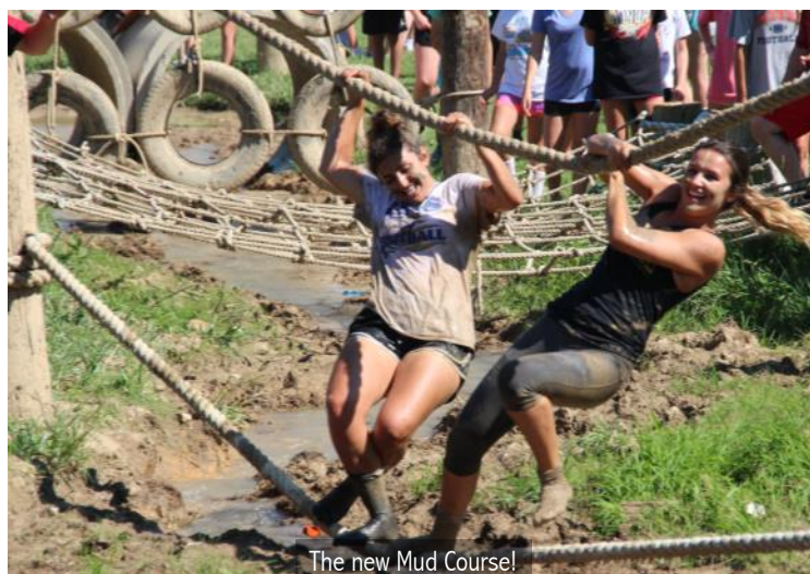
The new Mud Course!