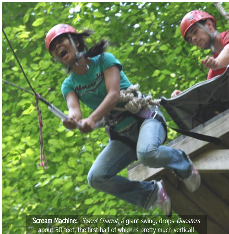
Scream Machine: Sweet Chariot , a giant swing, drops Questers about 50 feet, the first half of which is pretty much vertical!