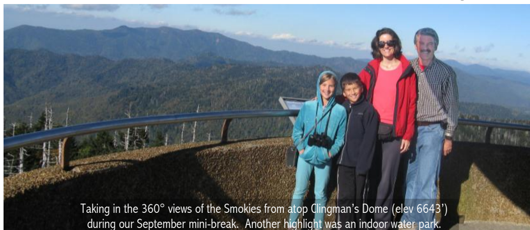
Taking in the 360° views of the Smokies from atop Clingman's Dome (elev 6643') during our September mini-break. Another highlight was an indoor water park.