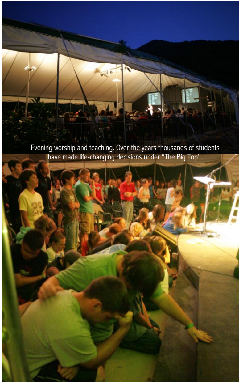
Evening worship and teaching. Over the years thousands of students have made life-changing decisions under "The Big Top".