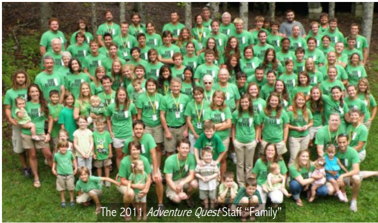
The 2011 Adventure Quest Staff "Family"